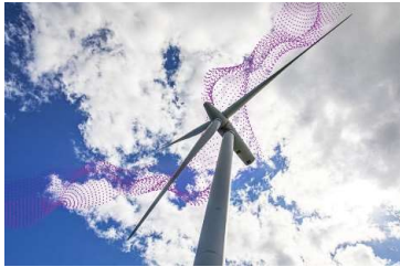
Climate and energy