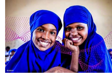
Education and research